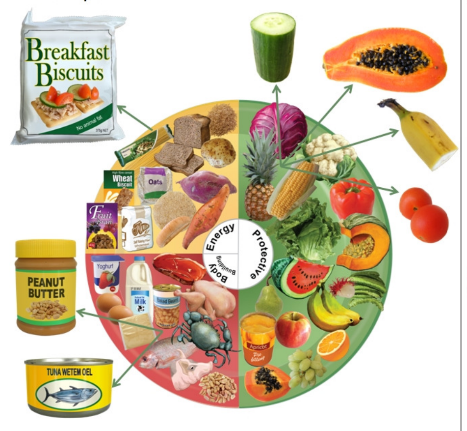
Serves in tuna salad breakfast biscuits